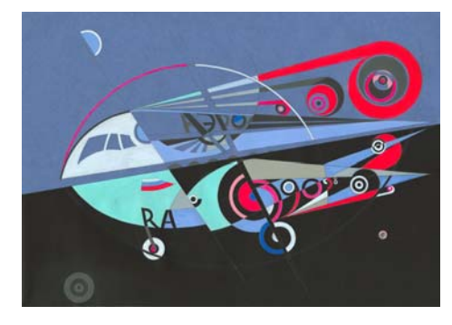
Techno-zone Series. On fire from my emotions 2019 42 x 59,5 cm