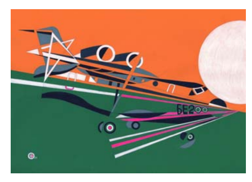
Techno-zone Series. Black Plane 2021 Paperboard, fluorescent acrylic, pencil. 41.5 x 59 cm