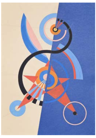
Androids Series. Clown Walking Star 2014 59 x 41,5 cm