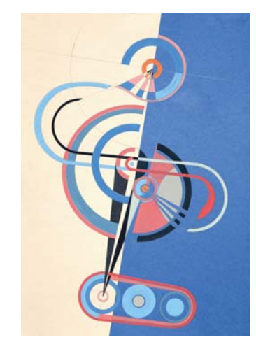
Androids Series. Conversion Clown 2015 59 x 41,5 cm