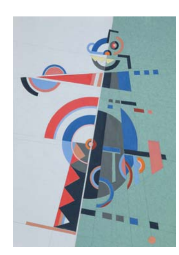
Androids Series. Metropolitan Clown 2014 59 x 41 cm