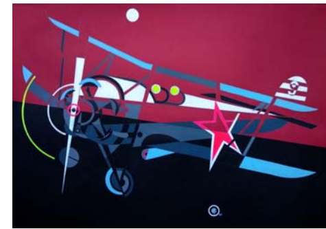
VICTORY PLANES. U-2 biplane. Polikarpov OKB 2020 Paperboard, fluorescent acrylic, pencil. 42 x 60 cm