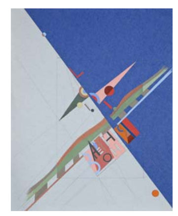
Techno-zone Series. Restricted area 2013 50 x 40 cm