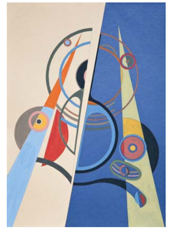
Techno-zone Series. Antivirus 2015 59,5 x 41,5 cm