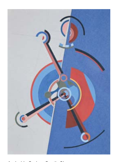
Androids Series. South Clown 2014 59 x 42 cm

an Art Critic, curator, and corresponding member of the Russian Academy of arts. 2015