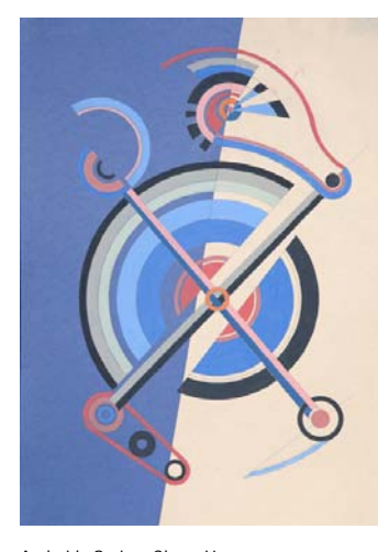
Androids Series. Clown H 2014 59 x 42 cm