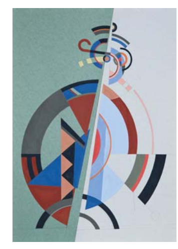
Androids Series. Agent Clown 2014 59 x 42 cm