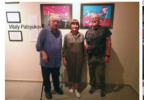
ONE FOR ALL. North Caucasus branch of the Pushkin State Museum of fine arts. 2020, Vladikavkaz, Russia