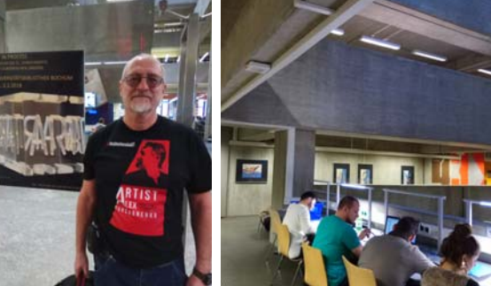
Art in process, RUB (Ruhr-Universität Bochum), 2018, Bohum, Germany http://www.ub.ruhr-uni-bochum.de/DigiBib/Aktuelles/artinprocess.html