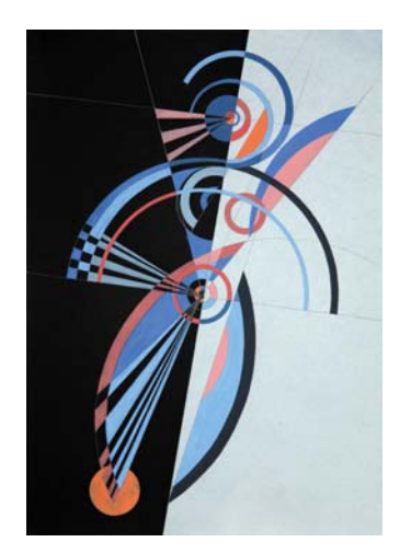
Androids Series. She-clown 2015 59 x 41,5 cm