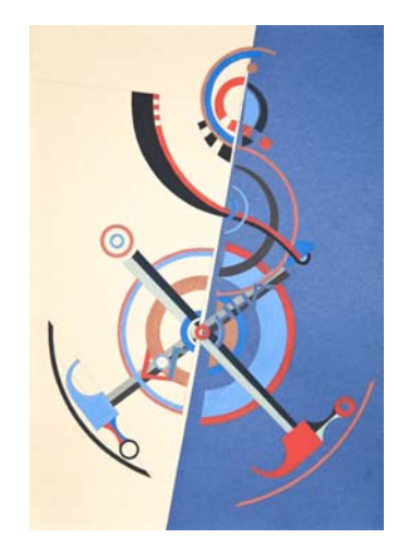
Androids Series. Pink Clown 2015 59 x 41,5 cm