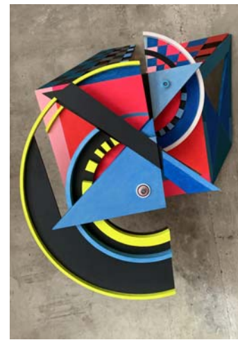
Alef Station. 2023 Biblical Names Series 3D sculpture. Plywood, fluorescent acrylic, metal 90 x 65 x 42 cm