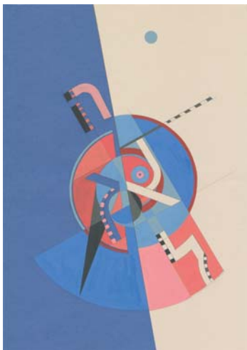
Lea | לֵאָה . 2016 Biblical Names Series Paperboard, tempera, pencil 59 x 41,5 cm