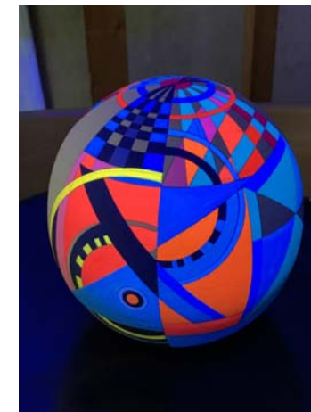
Magic Alef Ball. 2023 Biblical Names Series Plywood, fluorescent acrylic, lacquer H 15 cm. In UV