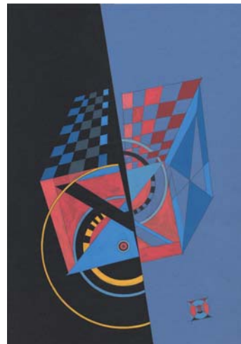
Alef | א . 2016 Biblical Names Series Paperboard, tempera, pencil 59 x 41,5 cm