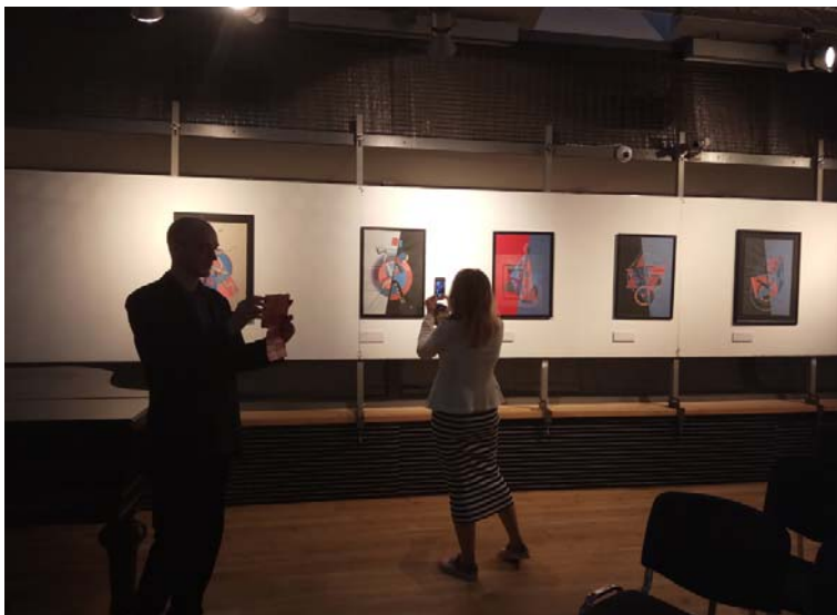
Magic of names. Project presentation. On July 04, 2017 NCCA. Moscow, Russia