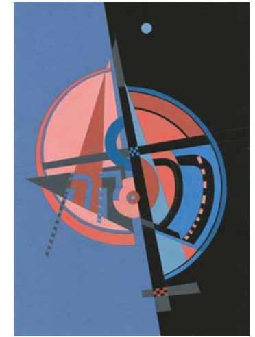
Rebecca | רבקה . 2016 Biblical Names Series Paperboard, tempera, pencil 59 x 41,5 cm