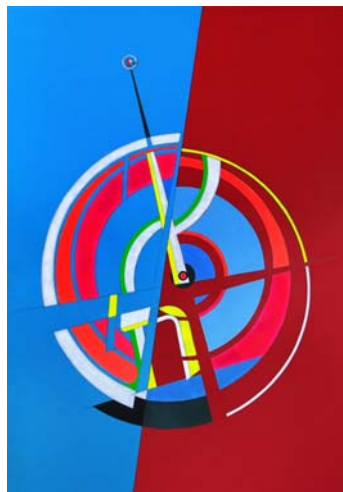
Itay | יִתְיָא . 2016 Series "The Magic of Calligraphy of a Name" Paperboard, fluorescent acrylic, pencil 59 x 41,5 cm