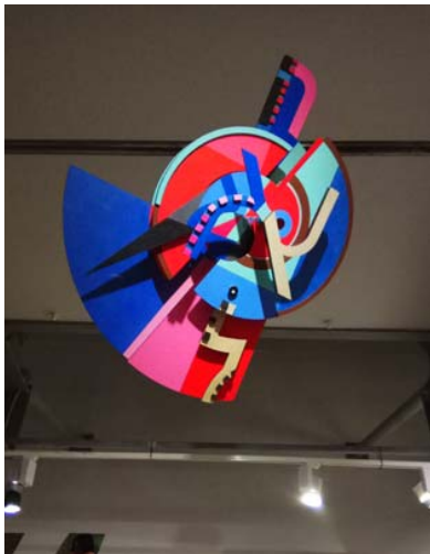
Geometry in the culture of XX–XXI centuries. To the centenary of the Bauhaus. 2019-2020. NCCA. Moscow, Russia