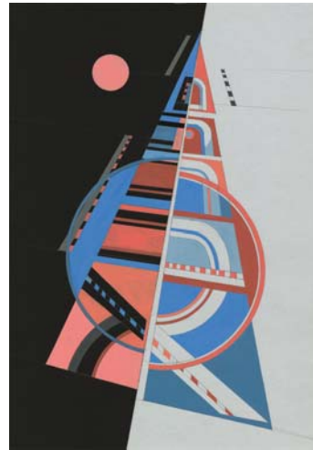
Abraham | אברהם . 2016 Biblical Names Series Paperboard, tempera, pencil 59 x 41,5 cm