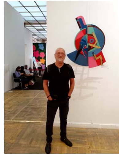
http://www.visit-city.com/exhibitions/new-reality/ New Reality. On the 100th anniversary of UNOVIS. 2020. New Tretyakov Gallery. Moscow, Russia