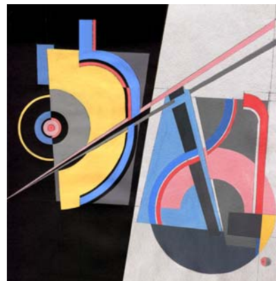
Nali | נָלִי . 2015 Series "The Magic of Calligraphy of a Name" Paperboard, tempera, pencil 60 x 60 cm