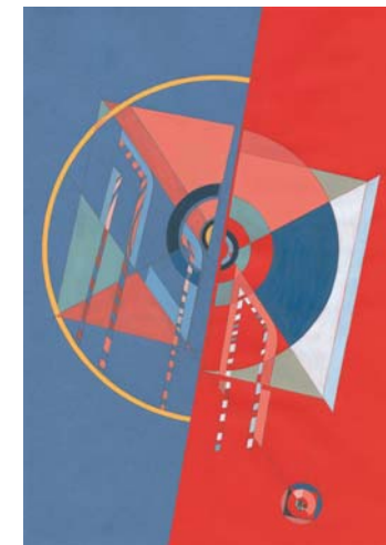
Hana | חַנָּה . 2016 Series "The Magic of Calligraphy of a Name" Paperboard, tempera, pencil 58,5 x 41,5 cm