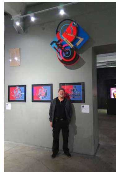
About Laziness. 2019-2020. ARTPLAY. Moscow, Russia