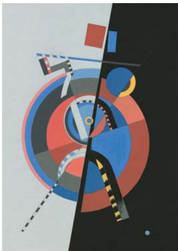
Rachel | רַחֵל . 2016 Biblical Names Series Paperboard, tempera, pencil 59 x 41,5 cm