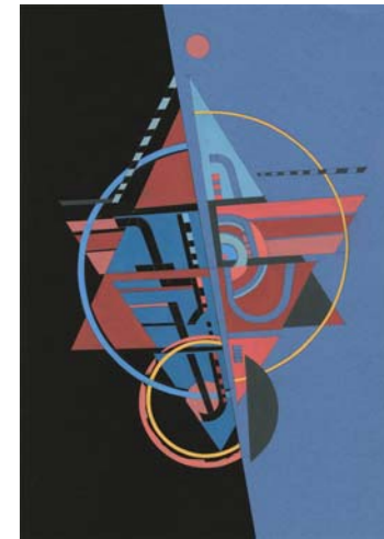
Sarah and Jacob | שרה ו יעקב . 2016 Biblical Names Series Paperboard, tempera, pencil 59 x 41,5 cm