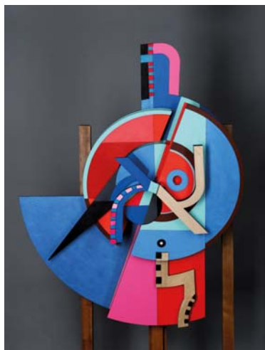
Galactic Station Lea. 2019 Biblical Names Series 3D sculpture. Plywood, fluorescent acrylic, metal 115 x 80 x 25 cm