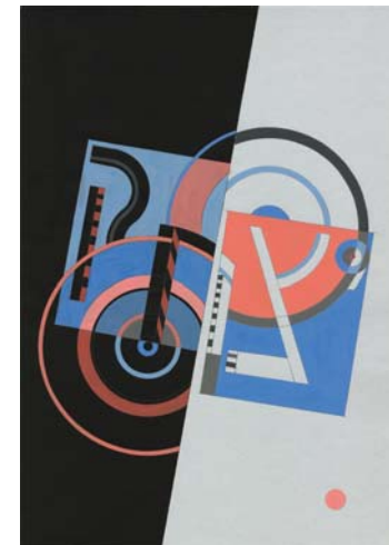
Isaac | יצחק . 2016 Biblical Names Series Paperboard, tempera, pencil 59 x 41,5 cm