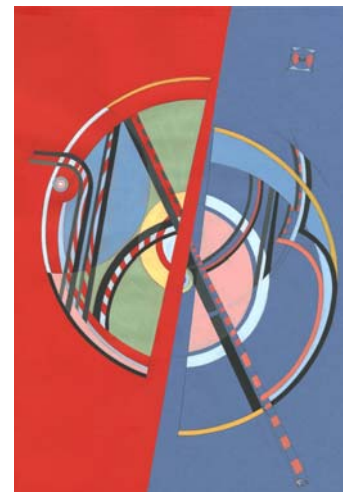
Lior | לִיאוֹר . 2016 Series "The Magic of Calligraphy of a Name" Paperboard, tempera, pencil 58,5 x 41,5 cm