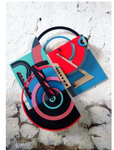
Galactic Station Isaac. 2019-2020 Biblical Names Series 3D sculpture. Plywood, fluorescent acrylic, metal 110 × 90 × 30 cm